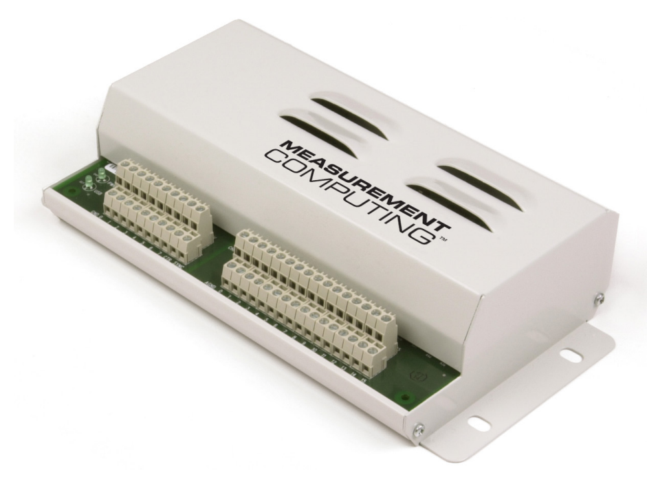
The USB-1616FS features simultaneous sampling of 16 single-ended analog inputs, 8 DIO lines, and a 32-bit event counter